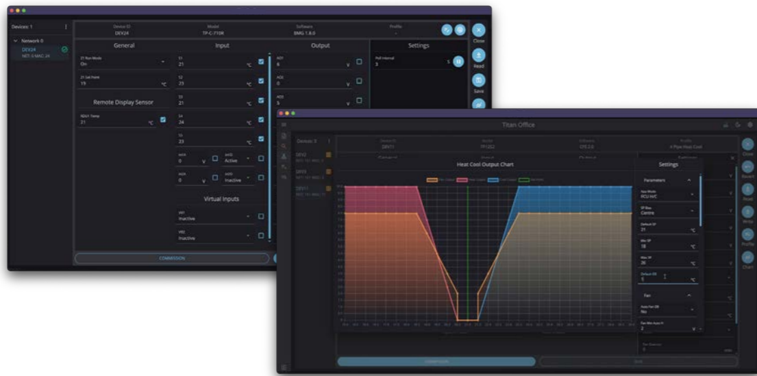
Titan ToolBox: Quickly navigate control library options to configure controllers in seconds View control strategy in graphical form to visualise the control strategy you build