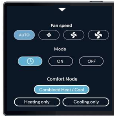
Zone 1 fan / mode adjustment