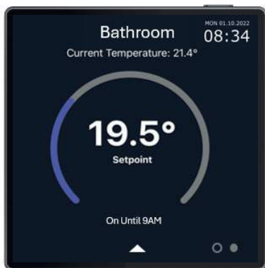
Zone 2 (heat only) set point adjust & indication