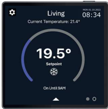
Zone 1 set point adjust & indication