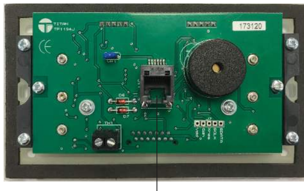
RJ11 cable connection