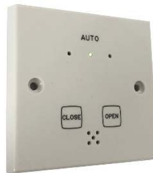
The ACO window override unit is also available in a flush mount assembly. (TP/ACO/F/W).